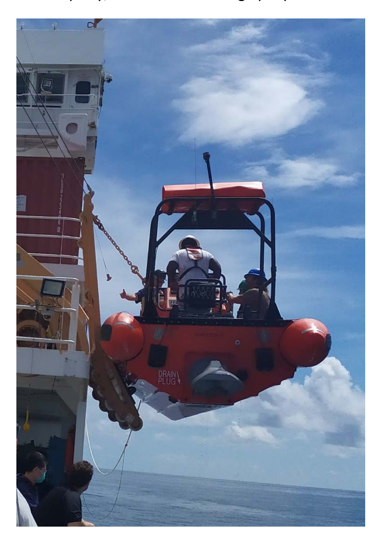
Figure 2: Small boat operation to pick up two additional scientists for our crew.

will join us later on, but in the meantime and with a little bit of good will from our outstanding science party, we now have enough people to collect and analyze our samples.